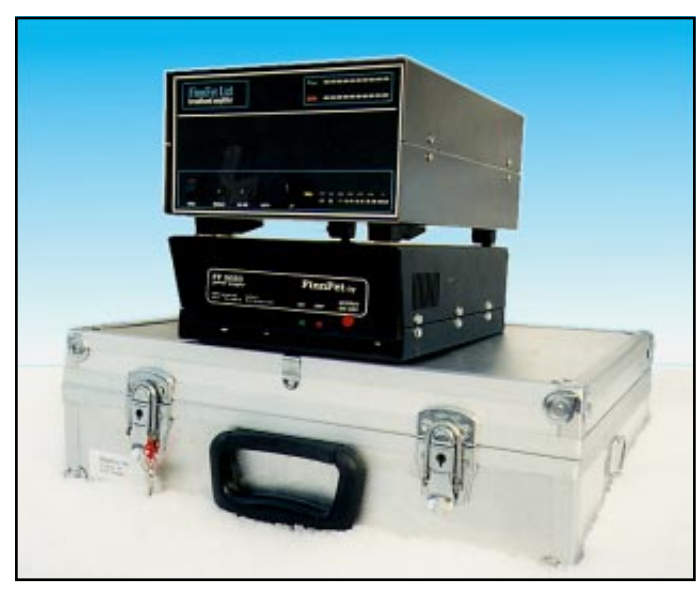
FF-1001 amp on top of FF-5050 power supply. FF-1001 dimensions 285x205x110 mm

Naturally no tuning is needed with these broadband amplifiers. Output power and SWR are indicated by LED bars on the front panel. There are also LEDs indicating auto band switching mode, overheating failure and on-theair status.